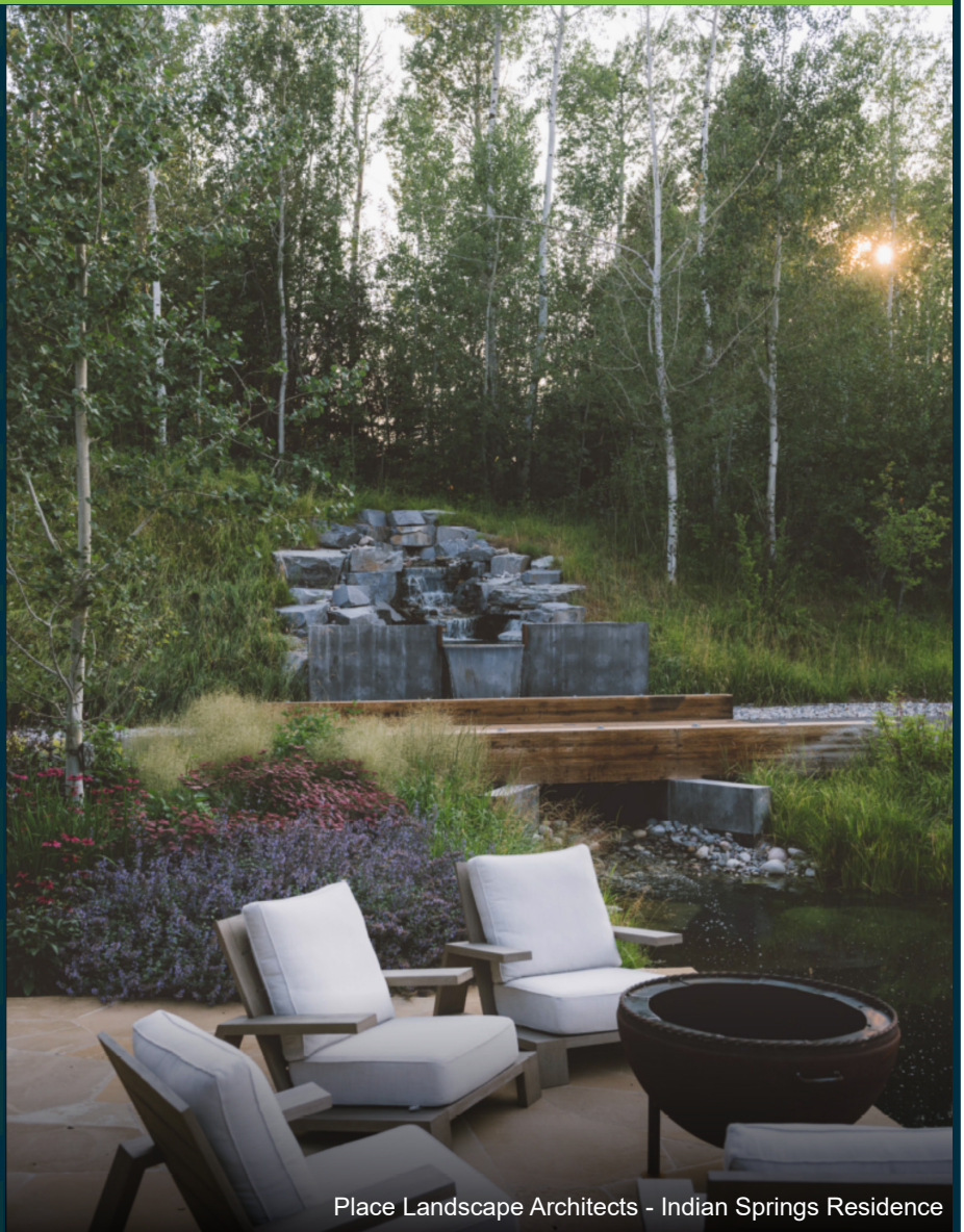
Place Landscape Architects - Indian Springs Residence

P.O. Box 8224 Boise, ID 83707 www.idmtasla.org info@idmtasla.org