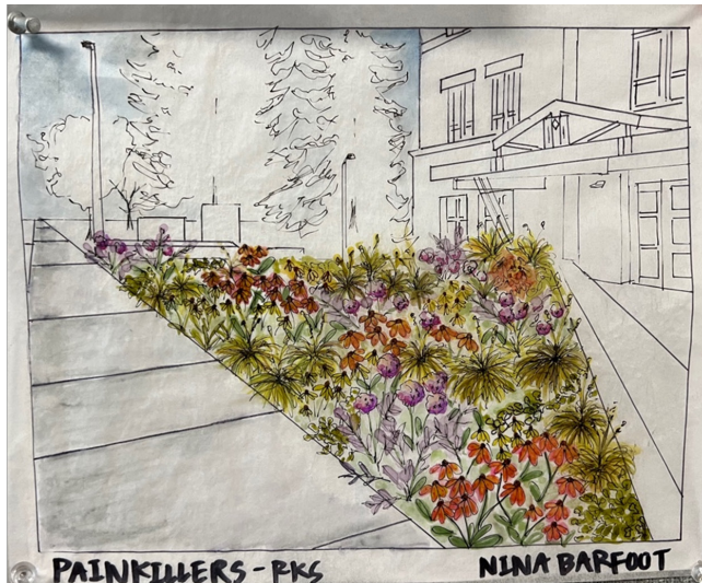
Student work from campus project in LARC 331 Planting Design Studio