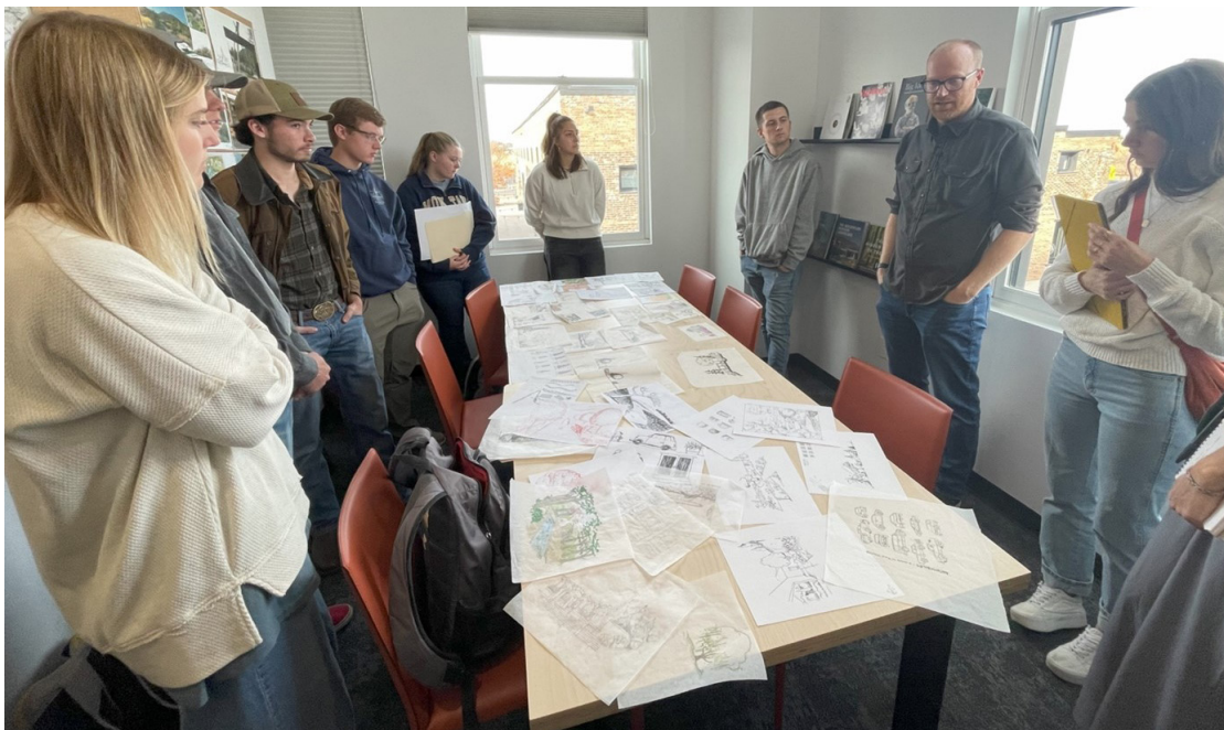
Sketch throwdown at BYLA-Bozeman firm visit with LARC 225 Landscape Graphics course