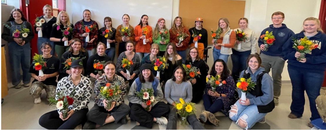
Departmental bouquet workshop