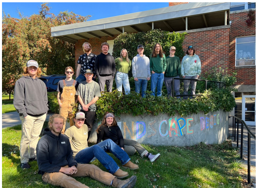
Senior LARC 432 Site Design II Studio