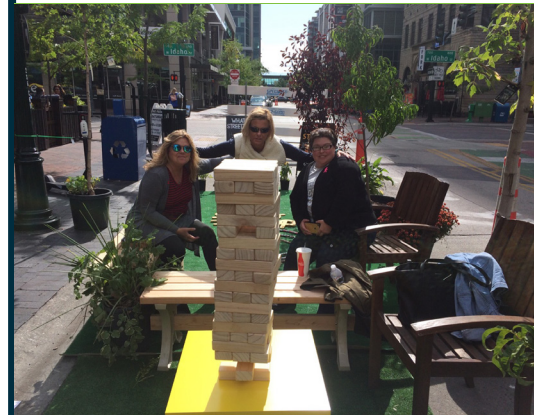
American Heart Association

Parking Day this year had a record turn out! In Coeur d'Alene the annual "PARK(ing) it on Sherman" once again was a great turn out with live music, vendors, and a huge crowd enjoying permanent and temporary parklets. There were 6 parklets in Boise including a huge parklet spanning 5 spaces! Boise participating businesses included AARP of Idaho, American Heart Association, Cole Architects, D.L. Evans Bank, Stack Rock Group, Energize Our Neighborhoods, Idaho Walk Bike Alliance, and Idaho Smart Growth.