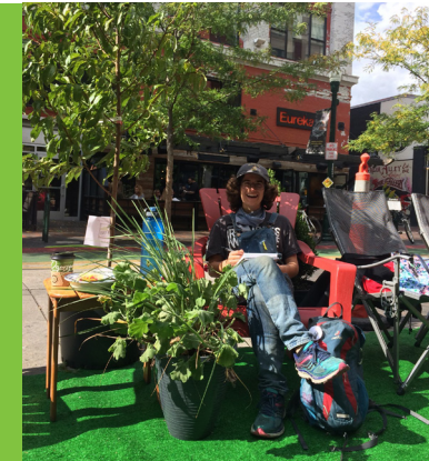
Idaho Walk Bike Alliance