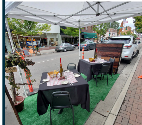
PV's Uncorked on Main

Over in Pocatello there were 14 parklets done by local businesses including Station Square, Old Town Pocatello, Portneuf Valley Brewing, The Elwen Cottage, PV's Uncorked on Main, The Yellowstone Restaurant, Mind Your Body, Salt and Honey, The Orange and Black Store, Main Steam Coffee and Desserts, Poky Dot Boutique, Snake River Fly, Cherub Capers Creations, Family Services Alliance of SE Idaho and Molinelli's Jewelers.