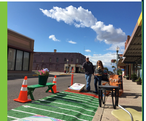
The Elwen Cottage